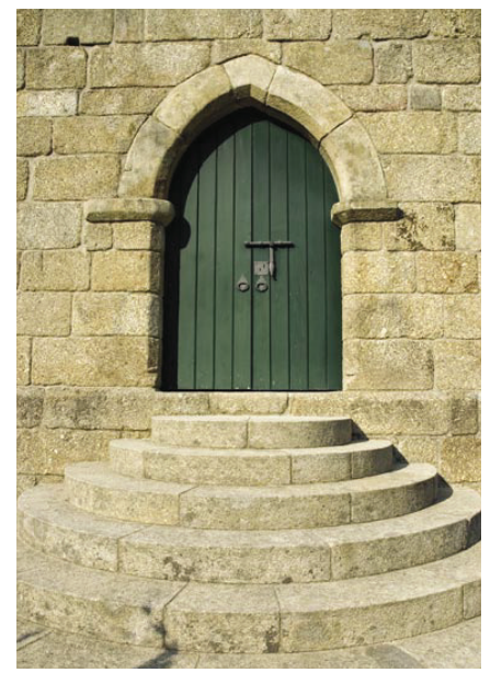
3. West portal. The absence of columns and tympanum points to a tardy chronology, within the frame of the Romanesque resistance .

In Saint Michael the portals do not feature any columns or tympanums, and the arches are systematically broken. The church does not bear capitals and the resource to impost blocks as a support for the arches, as well as the use of decorative elements based on geometric beveled foliage, as is the case of the vine