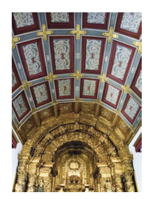
Transept. Main altarpiece and painted ceiling. The ceiling panels, by the altarpiece, feature emblems of Marian iconography.

It is important to note that the main retable also includes imagery and painting.