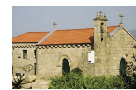
6. South and West façades.

The North portal, in broken arch, was doted with a richer decoration than the main portal, being framed by an archivolt decorated with diamond-tip motives and eight-petal faceted and beveled leaves, resembling the cross arch in the church's interior, elements that fit into the late Romanesque and the regional Gothic.