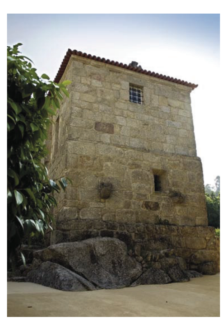
The transept's enlargement stems from a granitic layer.