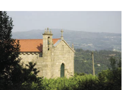
The church of Saint Michael of Entre-os-Rios is set in an important territory from the time of the Reconquest.

Among these territorial claims, strategic points were picked to create fortresses and establish the committees , representatives of the Astur-Leonine kings, to insure the safety and settling of the populations in frontier areas, always threatened by Muslim attacks<sup>3</sup>. The territorium of the civitas Anegia is set in a natural