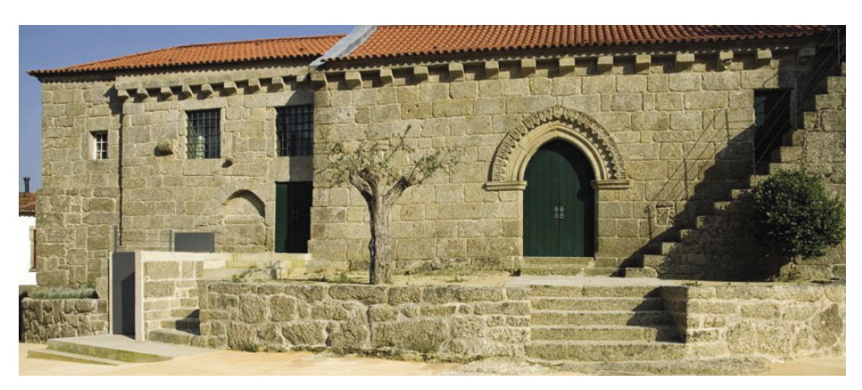
5. South façade. This façade's portal presents the same decorative solution as the triumph arch inside the church. The transept was lengthened and heightened after the original construction.

leaves, so common in the late Romanesque, are other aspects that place this church in a chronology close to the Gothic period, albeit the visible persistence of the Romanesque forms.