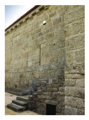
7. North façade

If, on one hand, it seems as if the West portal is posterior to the South portal, explaining the different construction projections, on the other hand, it is not rare that the lateral door received a more detailed decoration. In the Middle Ages, a church's building was not just an object built for a single purpose. It widely reflected the contemporary social and cultural networks. The parish church is much more than a space where the liturgy takes place and, thus, should be analyzed in relation to the village paths, the procession trails and the funerary rituals. The lateral portals, especially those in connection with the paths, were and still are more commonly used than the main portal. In the Land of Miranda it is not rare to see a higher decorative emphasis and apparatus in the lateral portals, as shown by the Church of Our Lady of Expectation of Malhadas (Miranda do Douro).