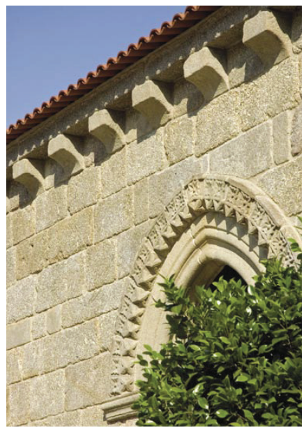
3. South façade. Portal finished with typical decoration rom the 14th century.

In the main chapel's North wall there is an arcosolium from the time of the medieval church, destined to house a tomb, which was partially cut by the placement of a door, in the Modern Period's restoration campaign. [LR]